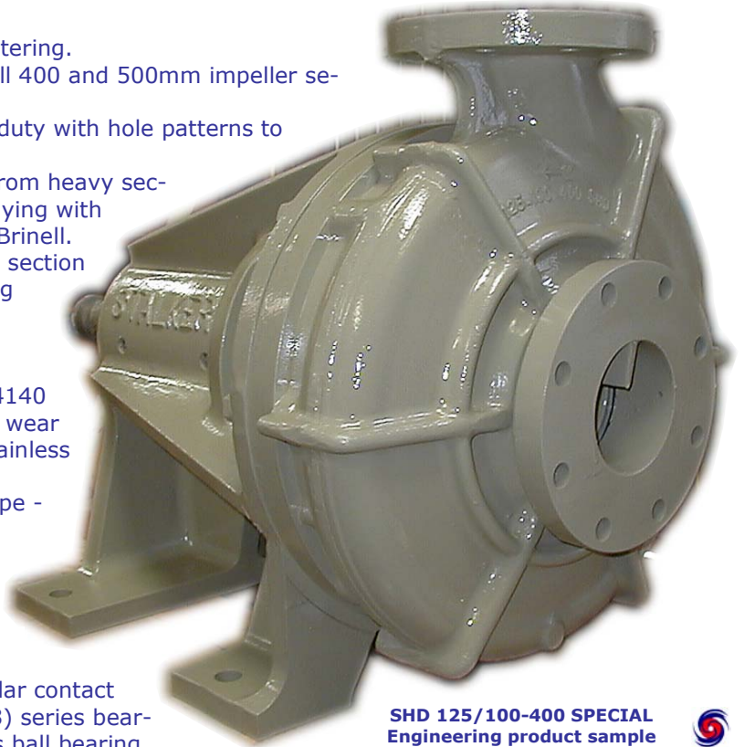
SHD 125/100-400 SPECIAL Engineering product sample